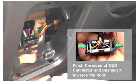
Figure 2: Removing OBD Connector and Installation