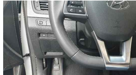
Figure 1 : Fuse box covered with von-U41